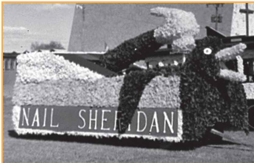
Class of 1970 Senior winning float.

From our different grade schools, we became the class of '70 in junior high. Moving to NHS in September 1966 was a daunting yet exciting event. Getting lost was a real possibility in such a big building. Academics occupied an important aspect of our high school life. Freshman entering NHS anxiously awaited to discover if they needed a bug collection and had to keep those "quiz sheets" ready. Determining who taught what class or how fortunate one was being assigned a specific teacher